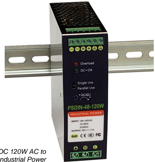
48VDC 120W AC to DC Industrial Power Supply

The PSDIN Series of Industrial DIN Rail mount high efficiency switching power supplies operate over a wide temperature range of -40C to +70C. There are two models to supply 120W or 240W. The input is 90 to 264VAC auto-ranging with wire terminal connections. The output is 48VDC nominal with an adjustment range from 47VDC to 56VDC. There is a switch for single or parallel operation. Two 240W supplies operating in parallel will provide 480W total power. There is an alarm output to provide a dry contact closure to trigger an alarm if the DC output fails, like during a grid power failure. The relay is closed when DC output is normal and open when DC output is in fault condition due to overload or safety shutdown.