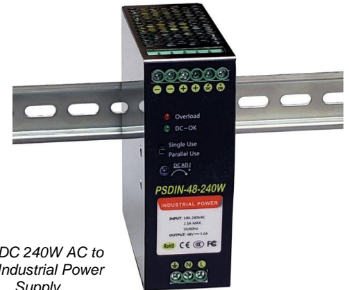
48VDC 240W AC to DC Industrial Power Supply