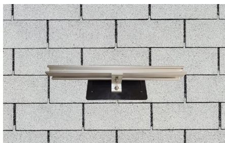
*Picture shows with short rail section for convenience