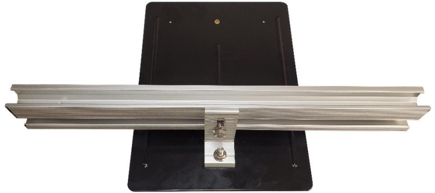
*Picture shows with short rail section for convenience