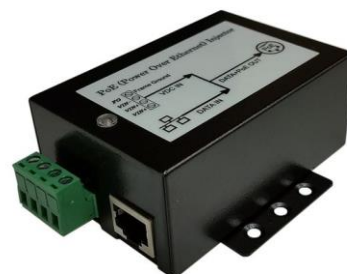
TP-DCDC-1248M (Metal Enclosure)