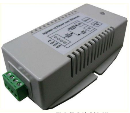
TP-DCDC-1248GD-HP 35W 802.3af/at