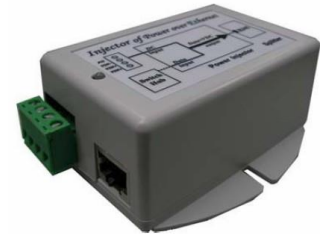
TP-DCDC-4848GD 17W 802.3af