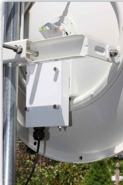
UBTik™ MOUNTED TO UBIQUITI ROCKETDISH (ROCKETDISH NOT INCLUDED)